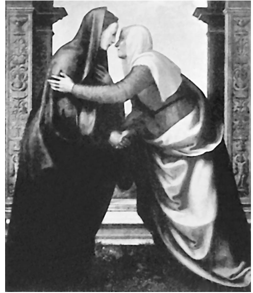
Visit to St. Elizabeth, by Mariotto Albertinelli, 1474-1515