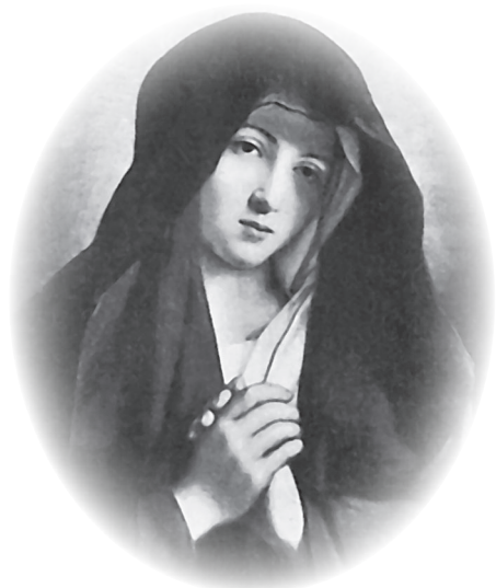
Mother of Sorrows, by Sassoferrato (Giovanni Battista Salvi), 1609-1685

The Fifth Glorious Mystery: The Coronation of Mary as Queen of Heaven (Rev 12:1-17)