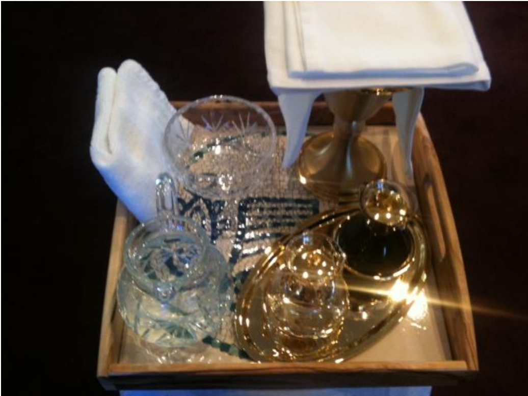
CREDENCE TABLE SET-UP OF SACRED VESSELS (WEEKEND MASS)